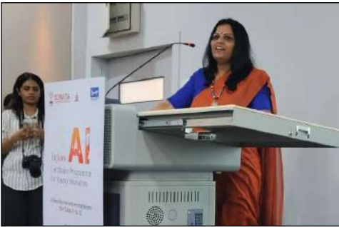
Our girls attended a two-day AI Certificate Programme: Shaping Future Innovators at Somaiya Vidyavihar University